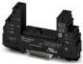
Base element for protective plug PT, for mounting on NS 35/7.5 and NS 35/15, housing width: 17.5 mm

Type 3 surge protection base element - PT-BE/FM - 2839282